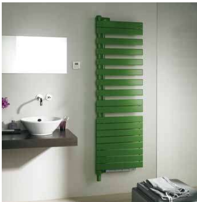
Radiator colour: Reseda Green